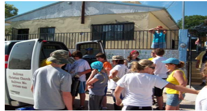
Sullivan, MO work group in Juarez